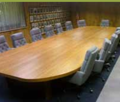
International Board Room