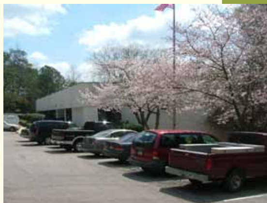
Civitan World Headquarters today