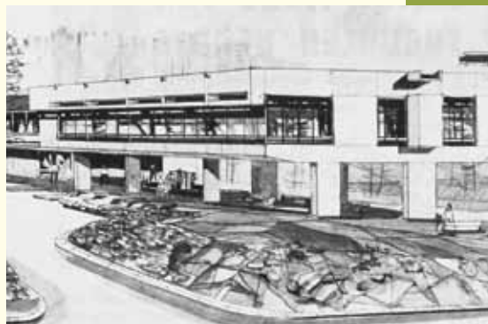
Design concept of the Civitan World Headquarters in 1974

Repairs in many areas are now direly needed, and cannot be postponed any longer. Even as this brochure is being printed, our air conditioning system has been down for a week in the heat of the Alabama summer. Donations to the Restoration Fund will not only pay for much-needed repairs, they will also fund energy-efficient renovations, replace worn-out equipment, and restore our home to its former glory.