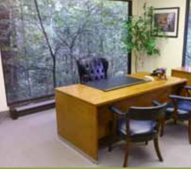
International President's Office